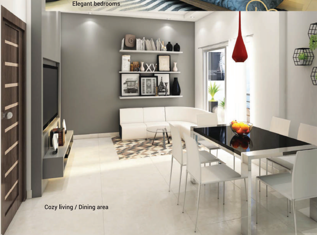
Cozy living / Dining area