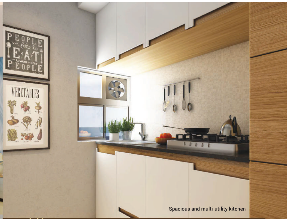
Spacious and multi-utility kitchen