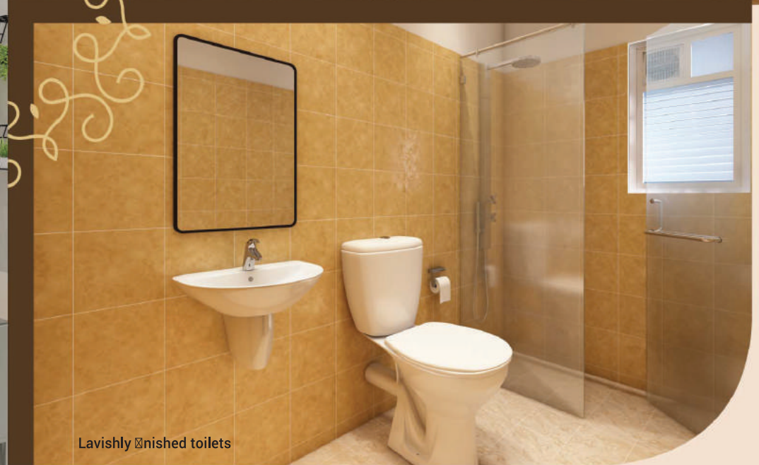
Lavishly finished toilets